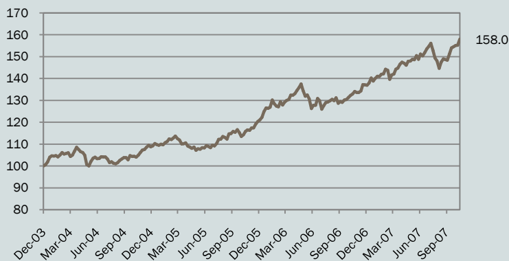
USP Price History